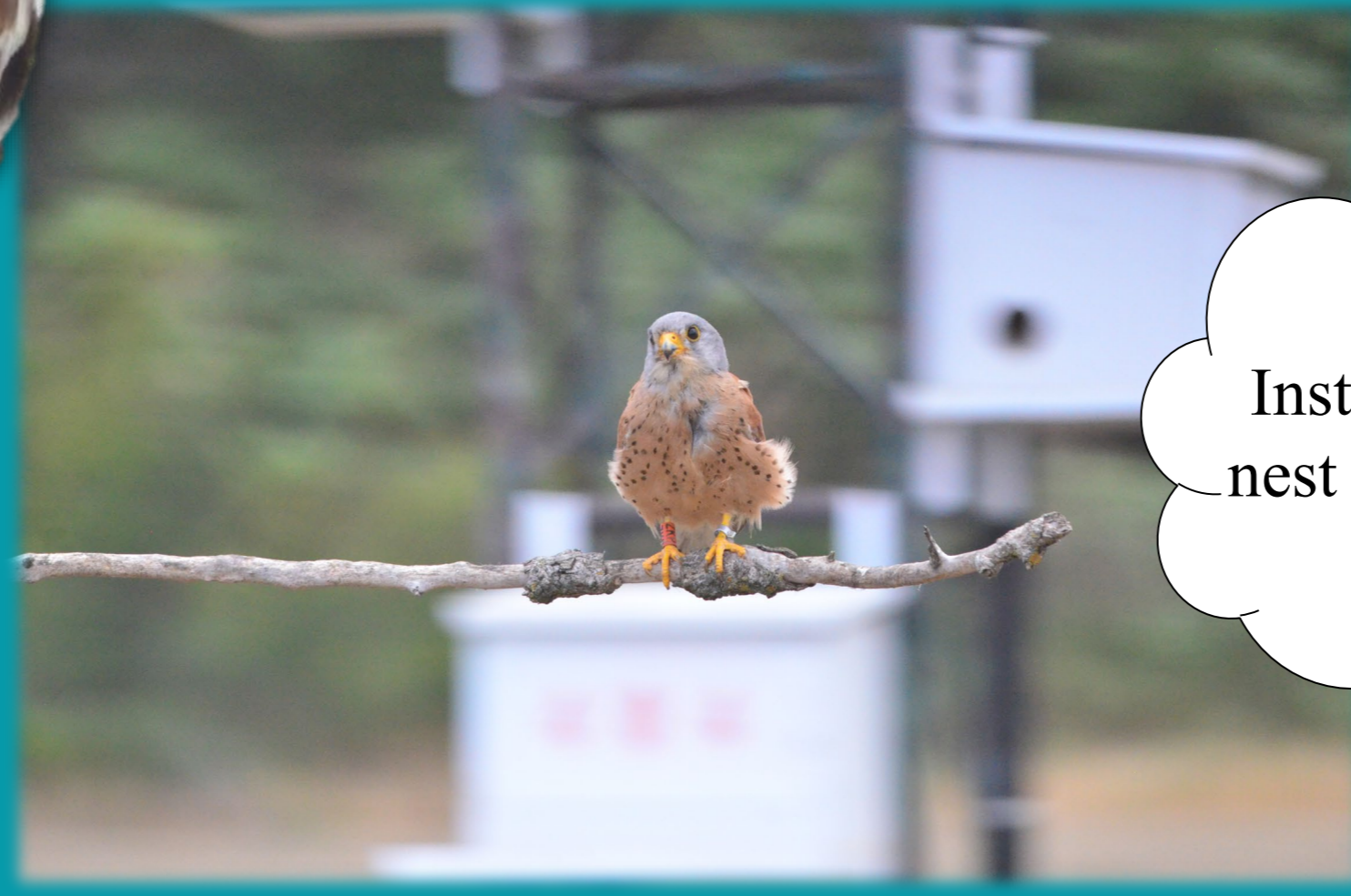
Installation artificial nest and artificial nest boxes