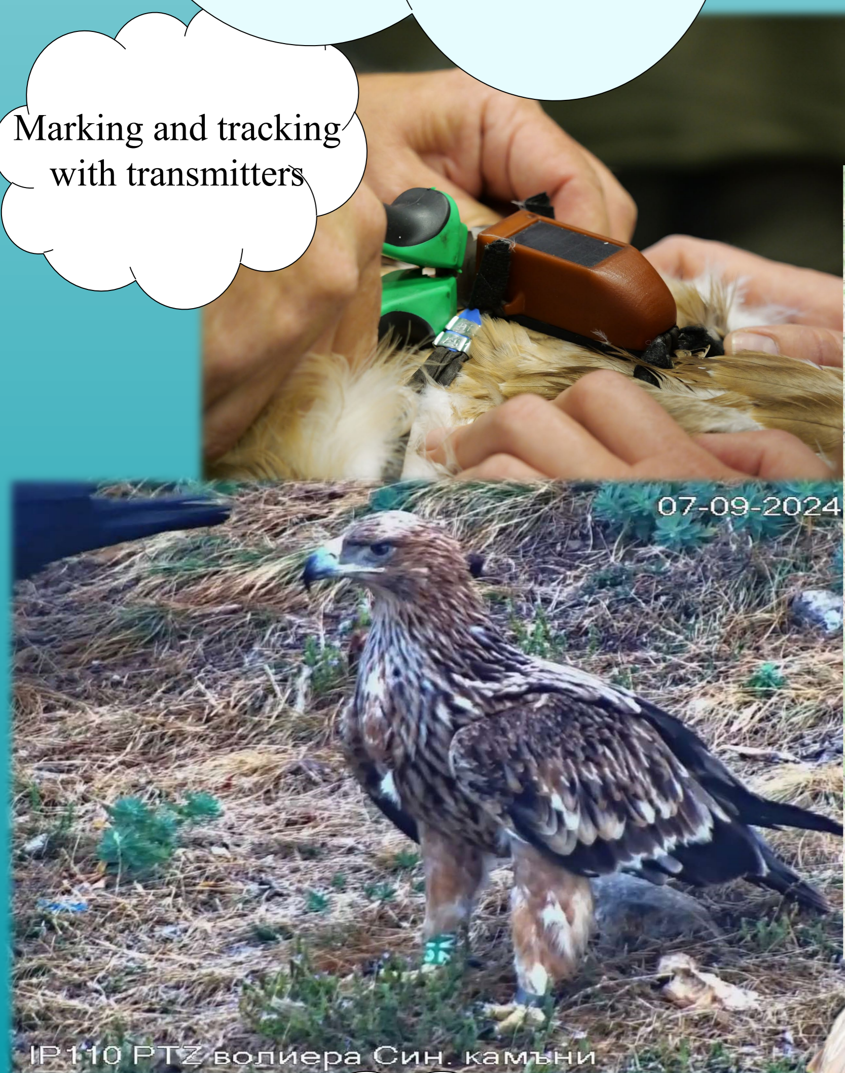
Marking and tracking with transmitters

The expected results of the project are conservation of the target species and improvement of their habitats in the Balkan Green Belt through direct conservation measures – marking and tracking with satellite transmitters, improving nesting habitats, installing of nest boxes, afforestation with poplars suitable for nesting and an installation artificial nest. The protection of these two emblematic species and the drawing of public attention to targeted conservation measures is a good basis for promoting the biodiversity in the Green Belt and the natural wealth.