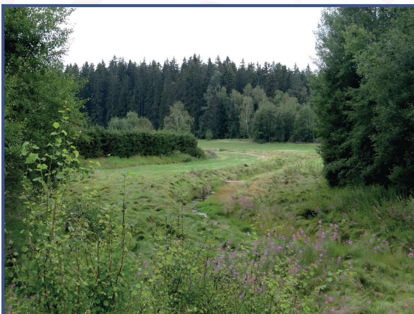
Kalte Moldau, Pilot Region 1 at the czech-german border

The improvement of CAPACITIES of responsible public bodies and NGOs lead to a better understanding of the ecological importance and the value for human wellbeing of the EGB. Also, REGIONAL GUIDING PRINCIPLES & RESTORATION CONCEPTS were developed for each of the Pilot Regions in order to set goals and suggest appropriate measures to reach them.